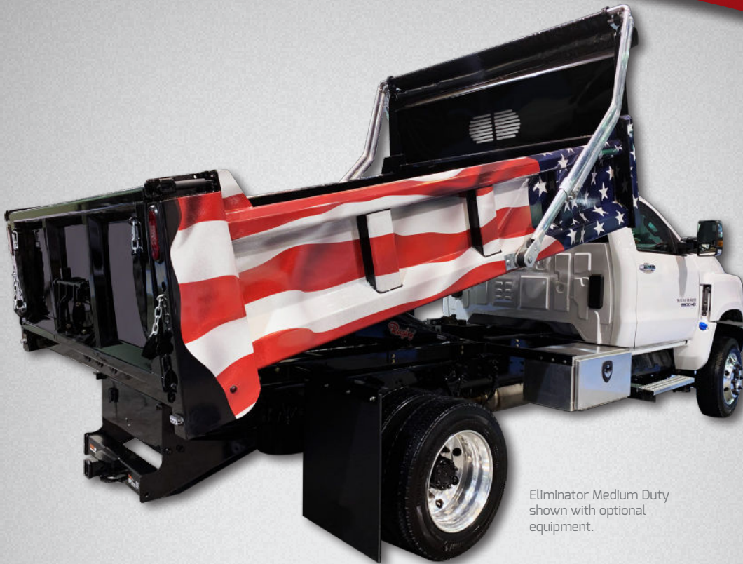
Eliminator Medium Duty shown with optional equipment.