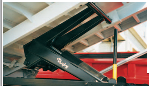
Dump Body Package Includes LR Series Hoist