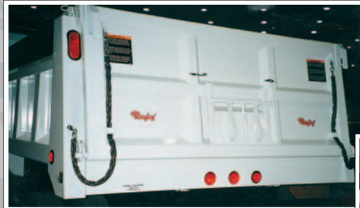
Optional Coal Chute Door Installed

NOTE: See side chart for side height and tailgate height on all Titan Series Dump Bodies.